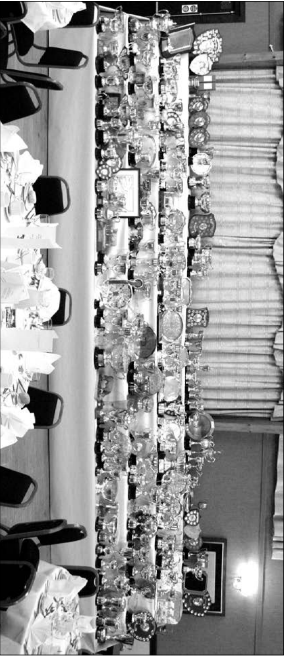
Turriff Show Trophies and Championship Prizes

These Trophies are again up for competition together with Championship Medals in all sections, which will be presented to their respective winners at our annual DINNER and PRESENTATION OF PRIZES due to be held in the Banff Springs Hotel, Banff on FRIDAY 28th OCTOBER 2022.